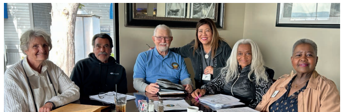
Chapter 22 - Oakland Leadership